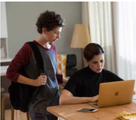
from Milton's Secret

I have been acting for a while now, and I am now approaching my grade nine year in school. For grade eight, I decided to take it a bit slower, to try and make sure I can get into school and know the routine, but now I would say I audition more often, and take what comes to me.