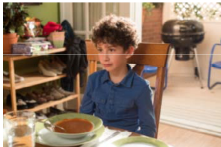
from The Christmas Secret

RH: After our last interview, many people asked me about your film The Christmas Secret . What was your experience like making that film? Any special memories?