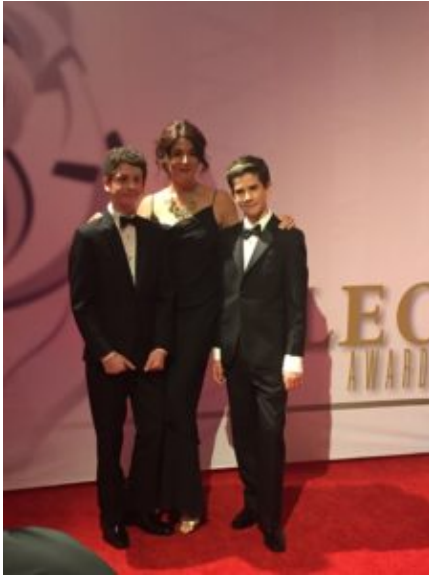
at the Leo Awards

You have been a major part of Ready, Jet, Go . What is it like being a part of such a recognized kid's show? What do you enjoy most about voice work? What do you find challenging?